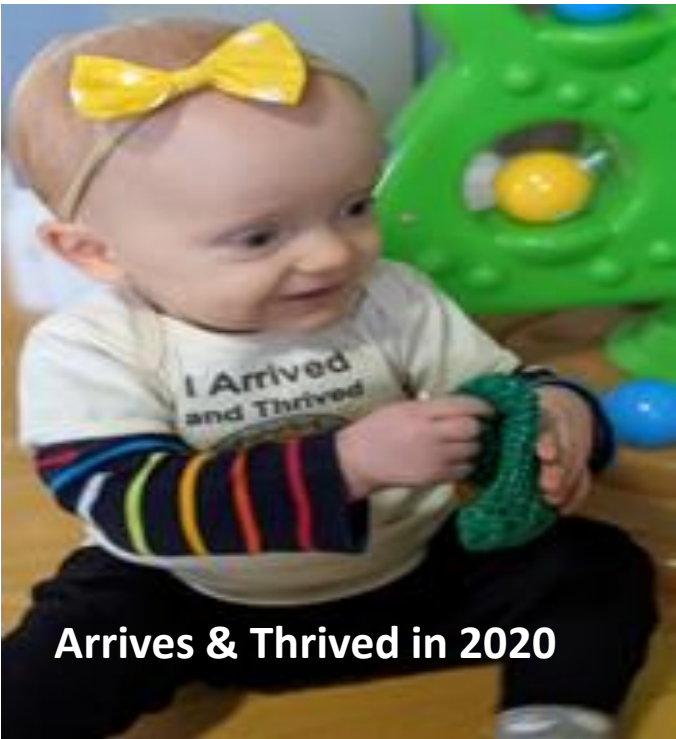
Arrives & Thrived in 2020